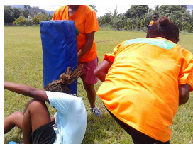
Young girls hitting pads

Not only does the Skills holiday program get boys and girls off the street, it educates them on topics such as drug and alcohol abuse, health education covering topics from hygiene & correct gym training, to TB and HIV. With input from representatives from ANGAU, PNGRC, AFP, and other volunteers.