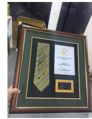
Framed 6 Nations tie Donated back to SCRUM