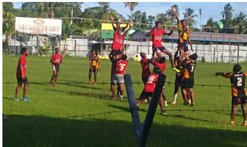
Boys compete for a line out.

The Morobe team was stacked entirely of SCRUM boys from our program and the fixture again encourages our young schoolboy juniors (under 18) to continue playing through the Under 20's ranks and onto senior rugby with the MRFU competition.