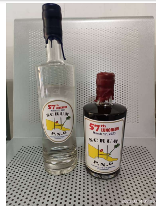
RAMU RUM & GIN