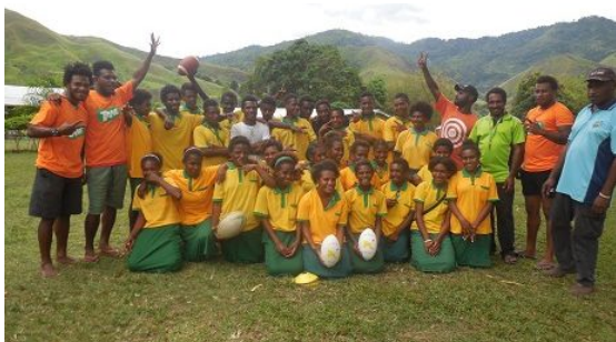
Young girls taking part in our Rugby Programs – Bulolo